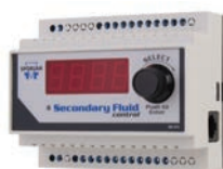
Secondary Fluid Control

Eliminate the hurdles to broader implementation of secondary glycol refrigeration systems with the Sporlan Secondary Fluid Control package. Laboratory and field installations have demonstrated case temperature stability within 0.5 degree of setpoint, and reductions in compressor cycling by up to 60%. Regulating glycol mass flow to meet the unique needs of each case results in an overall reduction in glycol pump speed and energy consumption.