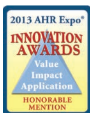
Secondary Fluid Valve

Together we can eliminate the headaches from system commissioning. Just set your case temperature, and walk away.